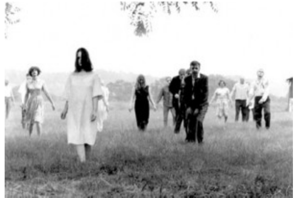
Scene from Night of the Living Dead

How do you get most of your information about zombies? (select all that apply)