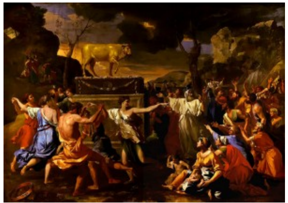
Nicolas Poussin (1594-1665) -- The Adoration of the Golden Calf

God also gave instructions on how to prepare the altar for worship. God told Moses again to rest on the Sabbath. The penalty for profaning the Sabbath was death. This was a sign between God and the Israelites, reminding them how God had made the world in 6 days, and rested on the 7th day. When God finished speaking with Moses, he gave him two tablets of stone, "written with the finger of God."