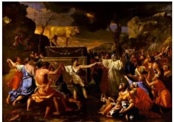
Nicolas Poussin (1594-1665) -- The Adoration of the Golden Calf

God also gave instructions on how to prepare the altar for worship. God told Moses again to rest on the Sabbath. The penalty for profaning the Sabbath was death. This was a sign between God and the Israelites, reminding them how God had made the world in 6 days, and rested on the 7th day. When God finished speaking with Moses, he gave him two tablets of stone, "written with the finger of God."